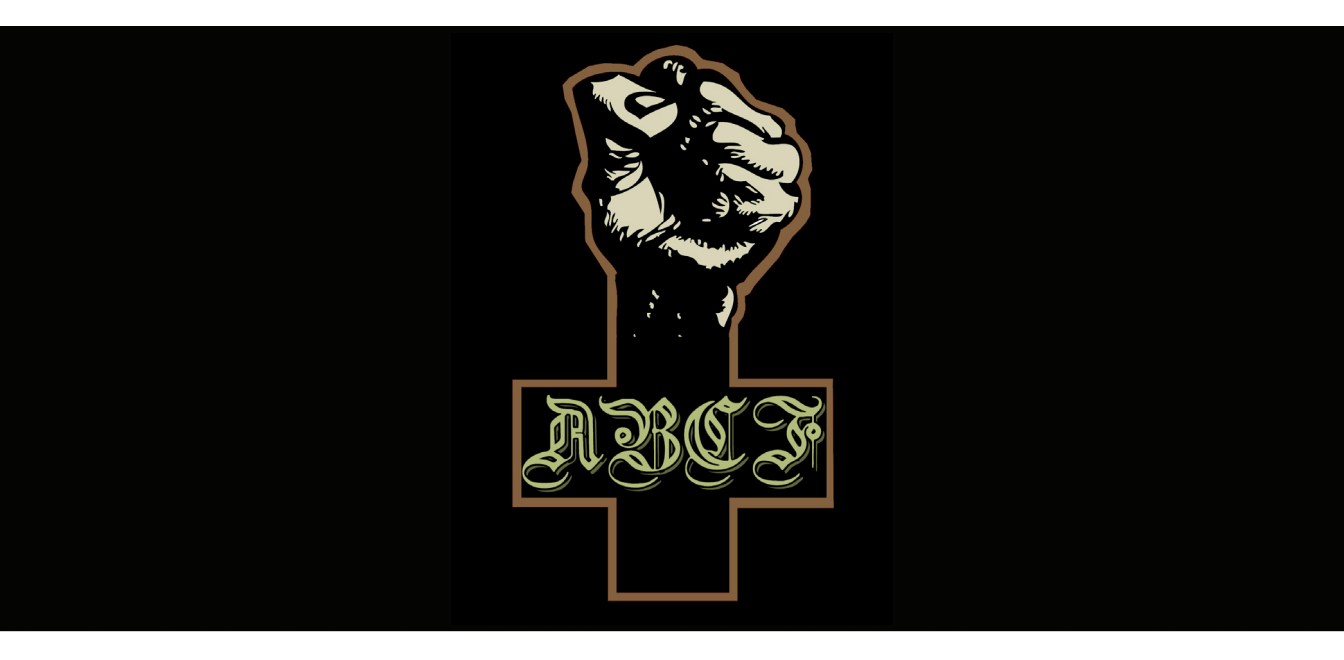
U.S. Political Prisoner and Prisoner of War Listing Edition 17.3, April 2024